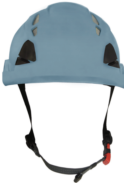
(Front with Chin Strap)