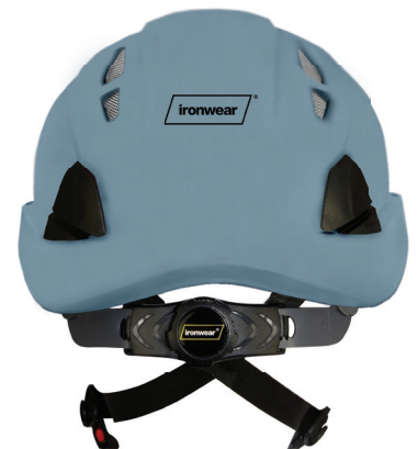
(Back with Ratchet)